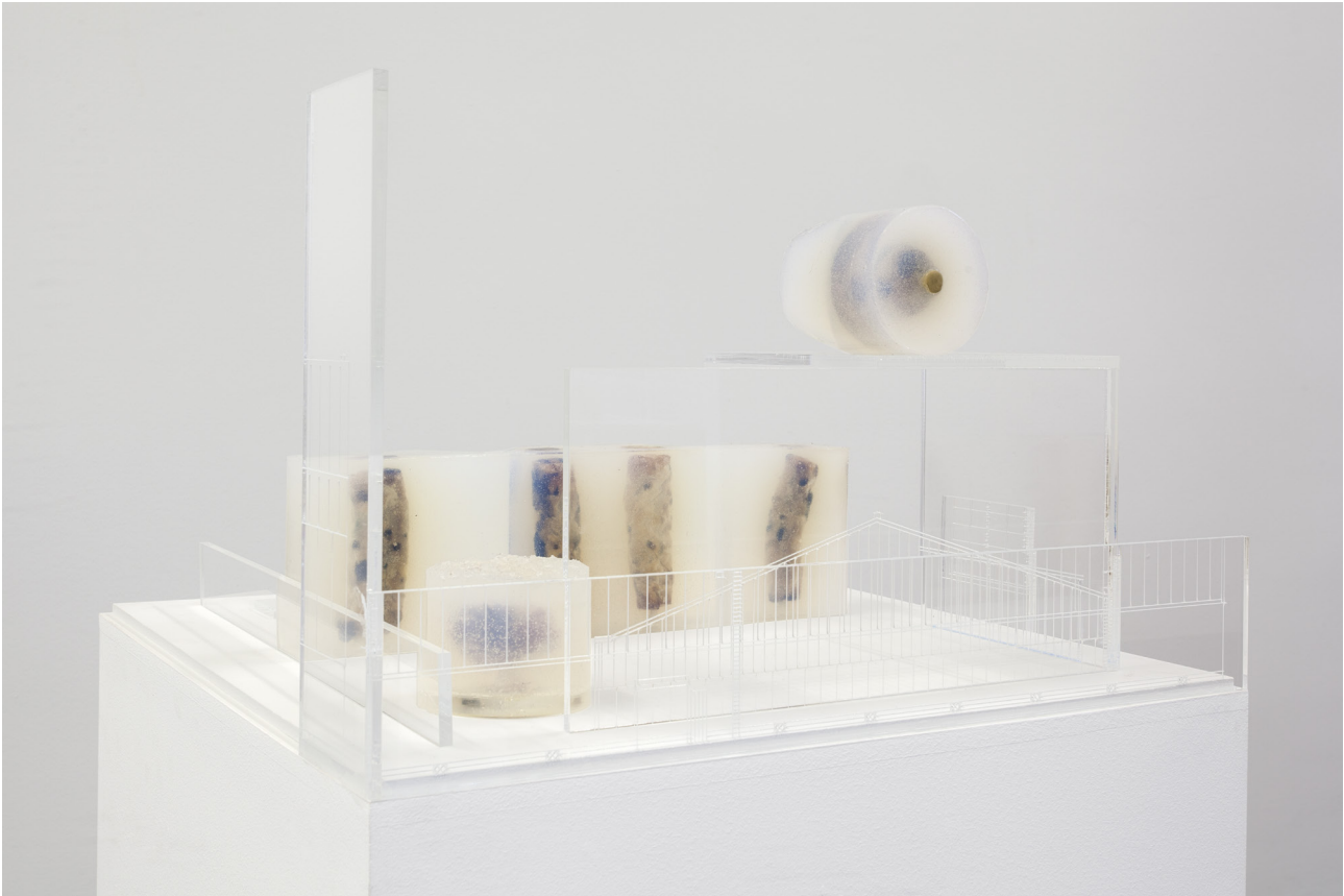
Jeehee Park, 1:1 x 1:99.475 / 5 , 2017. Neo Geography I, CAN